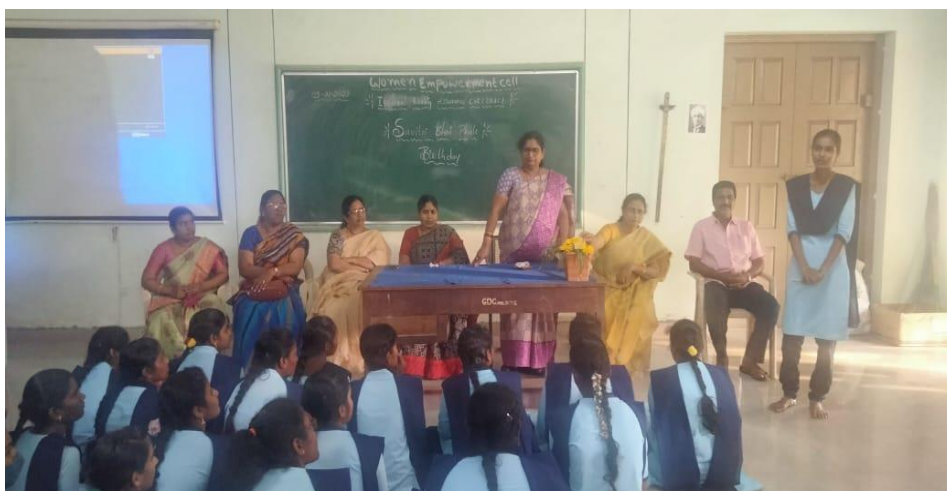
A student from II Bsc Data science delivered a speech about life history of savithri bhai phule